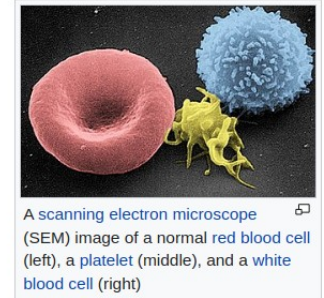
A scanning electron microscope (SEM) image of a normal red blood cell (left), a platelet (middle), and a white blood cell (right)

5A) Use Nadler's Formula for computing blood volume of a human (could be yourself, or a made up human). State your assumptions and show your calculations. State your answer in Liters!!